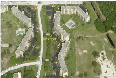
Built in 1980 - 117 units - 5 floors

Boca Teeca Condominium No 9 198 NW 67th St Boca Raton, FL 33487-8309 Tel: (561) 241-7654