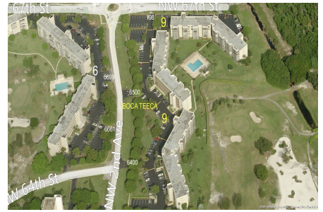
Built in 1980 - 117 units - 5 floors

Boca Teeca Condominium No 9 198 NW 67th St Boca Raton, FL 33487-8309 Tel: (561) 241-7654