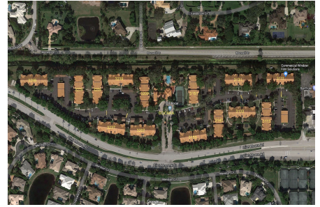
Built in 1991 - 196 units - 2 floors

THE BOCAR 3201 Clint Moore Rd, Boca Raton, FL 33496 (561) 998-3383 https://www.thebocar.com/