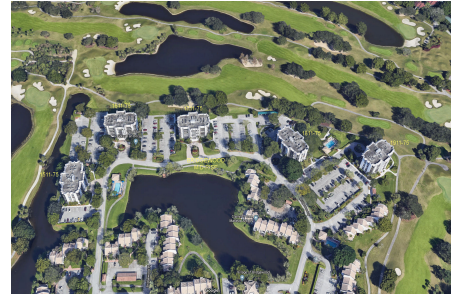
Built in 1974 - 190 units - 7 floors