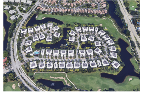
Built in 1989 - 176 units - 2 floors

Catalina at the Polo Club Condominium Association Inc 951 Broken Sound Parkway 250 Boca Raton, FL 33487 (561) 994-1788