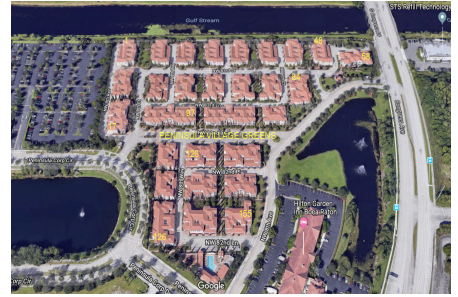
Built in 2007 - 155 units - 2 floors

Number of units: 155 Number of active listings for rent: 2 Number of active listings for sale: 0 Building inventory for sale: Number of sales over the last 12 months: 0% Number of sales over the last 6 months: 4 Number of sales over the last 3 months: 0