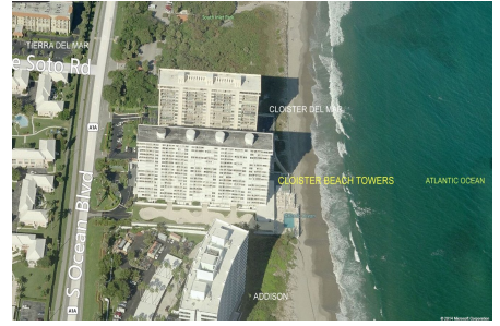
Built in 1966 - 126 units - 18 floors

Cloister Beach Towers Association, Inc. 1200 South Ocean Blvd Boca Raton, FL 33432 T: 561-391-0286 F: 561-391-5183 Web: http://cbt1200.com Email: cbt1200@gmail.com http://www.cloisterbeachtowers.com/