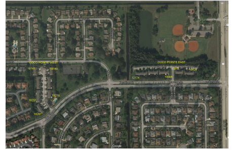
Built in 1999 - 60 units - 2 floors

Boca Pointe Community Association 6909 SW 18th Street, Suite A120 Boca Raton, FL 33433 (561) 395-7551 https://www.bocapointe.com/index_normal.html