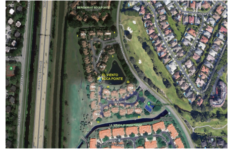
Built in 1985 - 99 units - 2 floors

El Viento At Boca Pointe Condominium Assn Inc 7918 Granada Place Boca Raton, FL 33433 (561) 982-8633