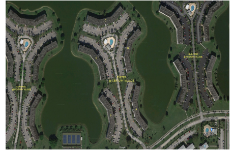
Built in 1980 - 360 units - 4 floors

Century Village at Boca Raton Address: 19296 Lyons Rd, Boca Raton, FL 33434 Phone: +1 561-451-1211