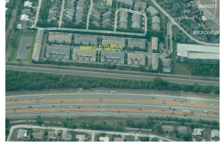
Built in 2005 - 84 units - 3 floors

Fairfield Gardens Homeowners Association, Inc 4755 Tech Way # 202 Boca Raton, FL33431 (561) 989-5053