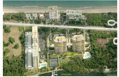
Built in 1980 - 81 units - 18 floors

La Fontana Condominium Association 2003 N Ocean Blvd, Boca Raton, FL 33431, +1 561-368-8494