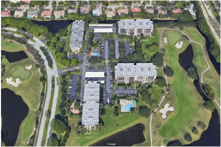
built in 1980/1985 - 200 units - 8 floors

Laurel Oaks Condominium Associates Address: 20100 Boca W Dr, Boca Raton, FL 33434 Phone: +1 561-483-8898