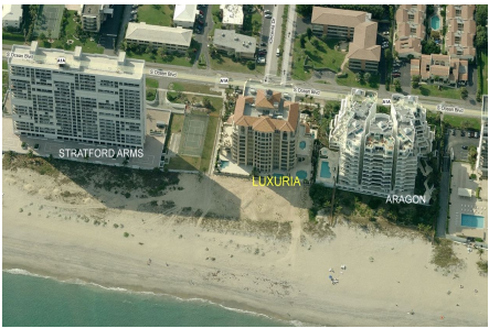
Built in 2010 - 26 units - 10 floors

Luxuria condominium association inc 2500 S Ocean Blvd, Boca Raton, FL 33432 (561) 391-1330