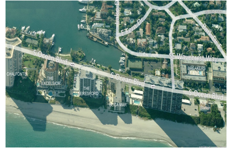
Built in 1975 - 150 units - 20 floors

The Marbella Condominium Association Inc 250 S Ocean Boulevard # LFB Boca Raton, FL 33432-6201 (561) 368-2869