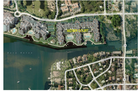
Built in 1988 - 199 units - 5 floors

MIZNER COURT CONDOMINIUM ASSOCIATION INC 100 SE 5TH AVE BOCA RATON, FL 33432-5071 (561) 393-6466 http://www.miznercourt.com/