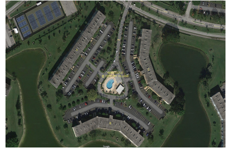
Built in 1981 - 224 units - 4 floors

Century Village at Boca Raton Address: 19296 Lyons Rd, Boca Raton, FL 33434 Phone: +1 561-451-1211