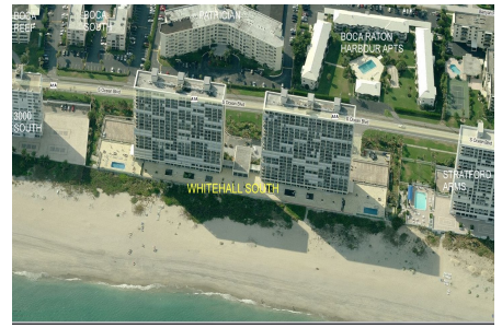
Built in 1973 - 252 units - 23 floors

Whitehall South Condominium Association Inc 2800 S Ocean Boulevard Boca Raton, FL33432-8332 (561) 391-6371 http://www.whitehallsouthcondo.com/