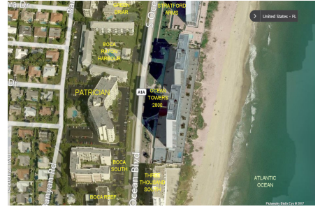
Built in 1980 - 127 units - 7 floors

The Patrician Condominium Association Inc 2851 South Ocean Blvd Apartment 4K Boca Raton, FL 33432 Phone: (561) 391-3130 Fax: (561) 391-1320 email: thepatriciancondo@gmail.com http://www.patriciancondo.com/