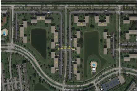
Built in 1980 - 378 units - 3 floors

Century Village at Boca Raton Address: 19296 Lyons Rd, Boca Raton, FL 33434 Phone: +1 561-451-1211