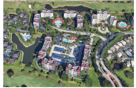
Built in 1987 - 96 units - 8 floors

Boca Pointe Community Association Address: 6909 SW 18th St A120, Boca Raton, FL 33433 Phone: +1 561-395-7551 https://www.bocapointe.com/index_normal.html