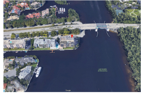
Built in 1975 - 17 units - 8 floors

Rogers East Condo Association 900 NE Spanish River Dr Boca Raton FL33431 (561) 392-2364 http://Boca Raton FL33431