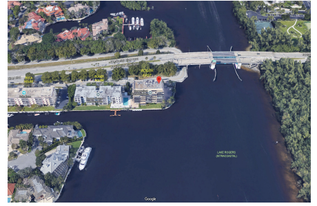
Built in 1975 - 17 units - 8 floors

Rogers East Condo Association 900 NE Spanish River Dr Boca Raton FL33431 (561) 392-2364 http://Boca Raton FL33431