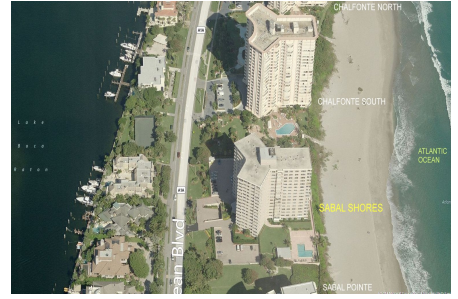
Built in 1970 - 124 units - 17 floors

Sabal Shores Apartments Association Inc 600 S Ocean Blvd, Boca Raton, FL 33432 (561) 394-2179