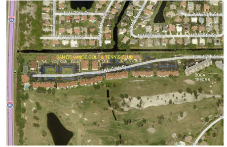
Built in 1990 - 172 units - 2 floors

Number of units: 172 Number of active listings for rent: 2 Number of active listings for sale: 2 Building inventory for sale: 1% Number of sales over the last 12 months: 7 Number of sales over the last 6 months: 5 Number of sales over the last 3 months: 4