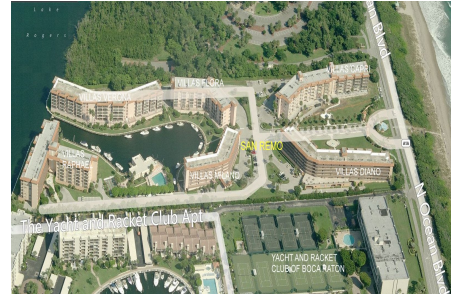
Built in 1967 - 295 units - 5 floors

San Remo Inc A Condominium 2871 N Ocean Blvd, Boca Raton, FL 33431 (561) 750-7775