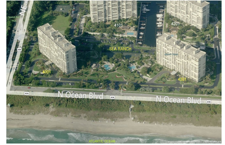
Built in 1981 - 247 units - 18 floors

SEA RANCH CLUB OF BOCA CONDOMINIUM ASSOCIATION, INC. LANG MANAGEMENT COMPANY INC PHONE 561-750-8800 FAX 561-750-4528