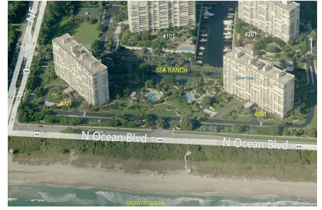
Built in 1981 - 247 units - 18 floors

SEA RANCH CLUB OF BOCA CONDOMINIUM ASSOCIATION, INC. LANG MANAGEMENT COMPANY INC PHONE 561-750-8800 FAX 561-750-4528