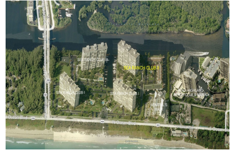
Built in 1988 - 158 units - 18 floors

Number of units: 158 Number of active listings for rent: 4 Number of active listings for sale: 9 Building inventory for sale: 5% Number of sales over the last 12 months: 12 Number of sales over the last 6 months: 8 Number of sales over the last 3 months: 3