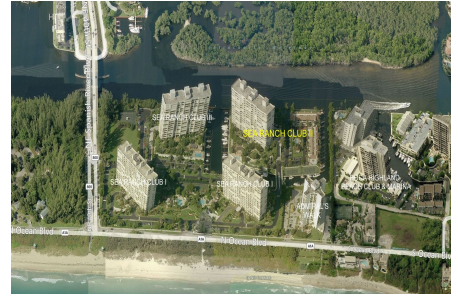
Built in 1988 - 158 units - 18 floors

Sea Ranch Club of Boca Condominium Association Inc 4301 N Ocean Blvd Ofc, Boca Raton, FL 33431 (561) 395-4723 (561) 395-0447