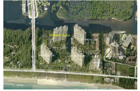
Built in 1990 - 142 units - 18 floors

Sea Ranch Club of Boca Condominium Association Inc 4301 N Ocean Blvd Ofc, Boca Raton, FL 33431 (561) 395-4723 (561) 395-0447