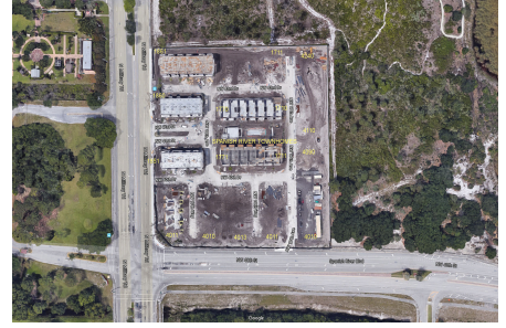
Built in 2017 - 75 units - 3 floors