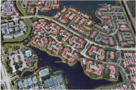
Built in 1981/1985 - 145 units - 2 floors