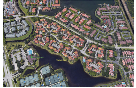
Built in 1981/1985 - 145 units - 2 floors