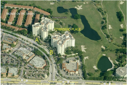
Built in 1998 - 194 units - 9 floors

Townsend Place Condominium Association 500 SE Mizner Blvd Boca Raton, FL 33432 (561) 393-7667