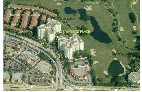
Built in 1998 - 194 units - 9 floors

Townsend Place Condominium Association 500 SE Mizner Blvd Boca Raton, FL 33432 (561) 393-7667