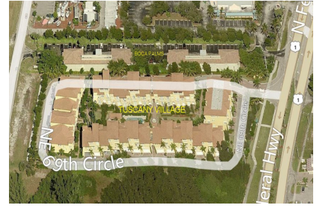
Built in 2006 - 37 units - 2 floors

Tuscany Village HOA Inc 12801 Sw 133rd St Miami, FL 33186 Phone: (305) 251-1149