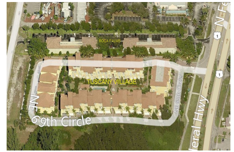
Built in 2006 - 37 units - 2 floors

Tuscany Village HOA Inc 12801 Sw 133rd St Miami, FL 33186 Phone: (305) 251-1149