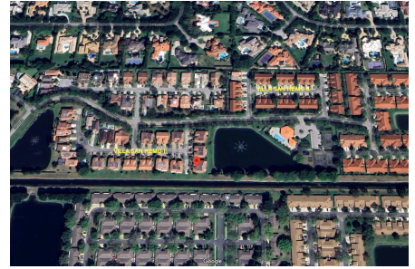
Built in 1989/1996 - 114 units - 2 floors

Villa San Remo Homeowners Association, Inc 3901 North Federal Highway # 202 Boca Raton, FL 33431 (561) 392-1600