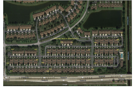
Built in 1988 - 280 units - 1 floor

Whisper Walk Property Manager Seacrest Services (561) 697-4990 http://www.seacrestservices.com/ https://www.whisperwalkinc.com/