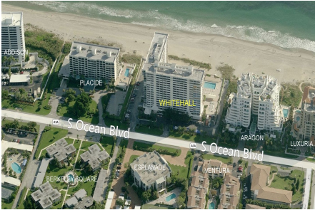
Built in 1971 - 162 units - 18 floors

Whitehall Condominium Association 2000 S Ocean Blvd, Boca Raton, FL 33432 561-391-7666