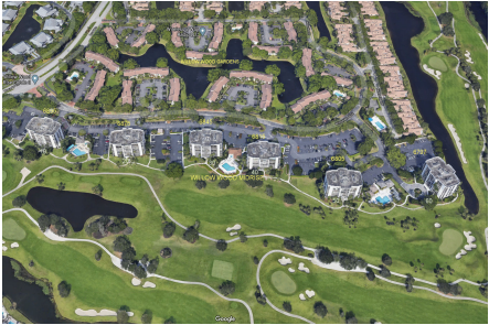
Built in 1980 - 276 units - 8 floors

Willow Wood Mid Rise Condo II Address: 6801 Willow Wood Dr, Boca Raton, FL 33434 Phone: +1 561-483-7356