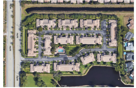
Built in 2000 - 78 units - 2 floors

BOYNTON OASIS J.A.N. Property Management 1313 W. Boynton Beach Blvd. Suite 1B-343 Boynton Beach, FL 33426 561.732.0303 https://boyntonoasis.com/