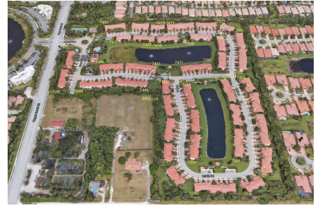
Built in 2006/2010 - 230 units - 2 floors

Briella Campbell Property Management 9897 Lake Worth Road, Suite 304 Lake Worth, FL 33467 Phone: (561) 432-2703 http://briellacondominium.com/