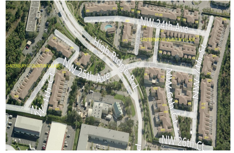
Built in 2005 - 153 units - 2 floors

Canterbury At Quantum Village Property Owners Association Of Palm Beach, Inc Banyan Property Management Service Banyan Property Management 2328 S Congress Ave Suite 1c West Palm Beach, FL 33406-7671 (561) 721-3549