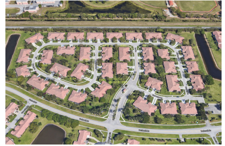
Built in 1998 - 130 units - 2 floors

Aberdeen Property Manager C/O Campbell Property Management 9897 Lake Worth Rd, Ste # 304 Lake Worth, FL 33467 https://www.aberdeenpoa.com/about-the-aberdeen-poa/villages-of-aberdeen/isles-of