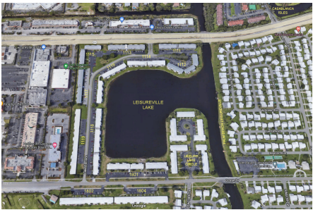
Built in 1973 - 295 units - 2 floors

Boynton Leisureville Community Association Address: 1807 SW 18th St, Boynton Beach, FL 33426, Phone: +1 561-732-2307