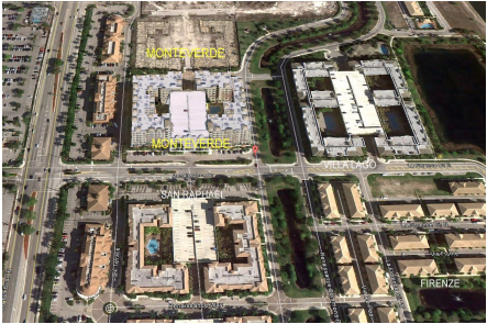
Built in 2007 - 447 units - 6 floors

MONTEVERDE CONDOMINIUM ASSOCIATION, INC. 1275 GATEWAY BLVD Boynton Beach, Florida 33426 (561) 736-3597