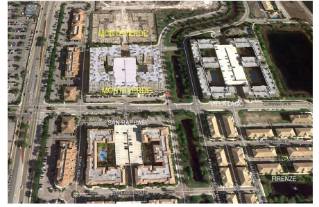
Built in 2007 - 447 units - 6 floors

MONTEVERDE CONDOMINIUM ASSOCIATION, INC. 1275 GATEWAY BLVD Boynton Beach, Florida 33426 (561) 736-3597