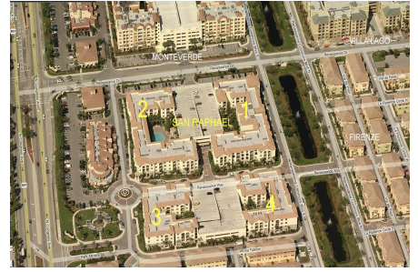
Built in 2006 - 242 units - 4 floors

San Raphael Condo Assn Inc 3412 Renaissance Way Boynton Beach, FL33426-8235 (954) 426-0151