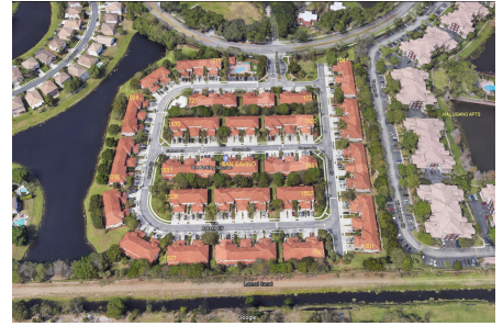
Built in 2001 - 128 units - 2 floors