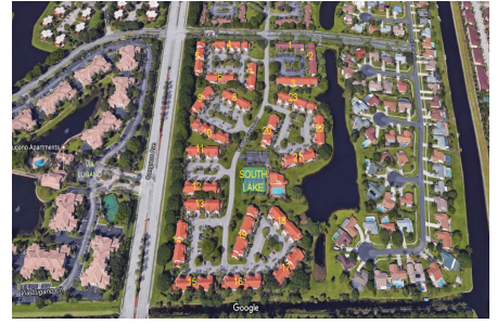
Built in 1984/1990 - 198 units - 2 floors

SOUTHLAKE I CONDOMINIUM ASSOCIATION, INC. Principal Address 1 VIA DE CASAS SUR BOYNTON BEACH, FL 33426 Mailing Address C/O CENTURY MANAGEMENT CONSULTANTS 2950 JOG ROAD LAKE WORTH, FL 33467