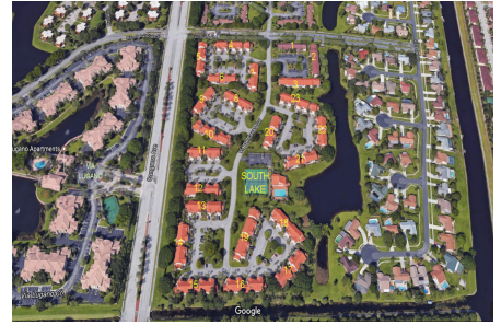
Built in 1984/1990 - 198 units - 2 floors

SOUTHLAKE I CONDOMINIUM ASSOCIATION, INC. Principal Address 1 VIA DE CASAS SUR BOYNTON BEACH, FL 33426 Mailing Address C/O CENTURY MANAGEMENT CONSULTANTS 2950 JOG ROAD LAKE WORTH, FL 33467