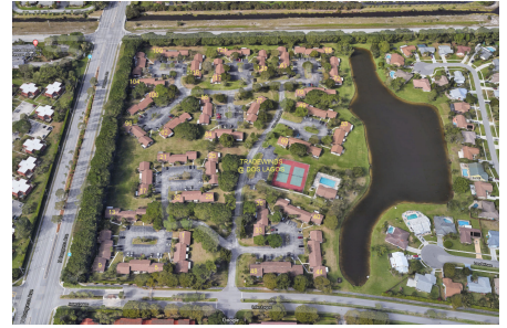
Built in 1984/1990 - 128 units - 1 floor

DOS LAGOS MASTER ASSOCIATION c/o GRS Community Management 3900 Woodlake Blvd. Suite 309 Lake Worth, FL 33463 TEL: 561-641-8554 FAX: 561-641-9448