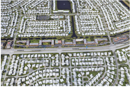
Built in 1979 - 152 units - 2 floors

Venetian Terrace Condo Association Address: 2061 W Woolbright Rd, Boynton Beach, FL 33426 Phone: +1 561-734-5652 http://venetianterrace.org/