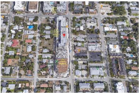
Built in 2019 - 32 units - 4 floors

236 Fifth Avenue Delray Beach Address: 236 SE 5th Ave, Delray Beach, FL 33484 Phone: +1 561-704-5559