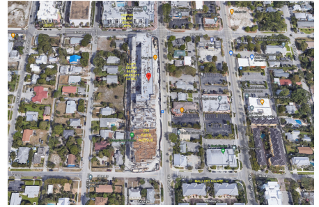
Built in 2019 - 32 units - 4 floors

236 Fifth Avenue Delray Beach Address: 236 SE 5th Ave, Delray Beach, FL 33484 Phone: +1 561-704-5559