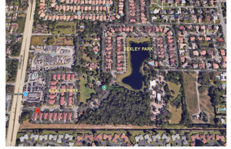
Built in 2005 - 163 units - 3 floors

Bexley Park Brock Property Management, Inc. P.O. Box 770850 Coral Springs, FL 33077 Phone 954-753-2675 Fax 954-340-8541 https://bexley-park.com/