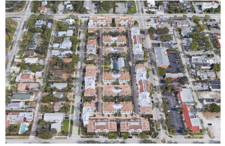
Built in 2010/2016 - 82 units - 3 floors

Cannery Row LLC 1118 Waterway Lane Delray Beach, FL 33483 (561) 279-8952