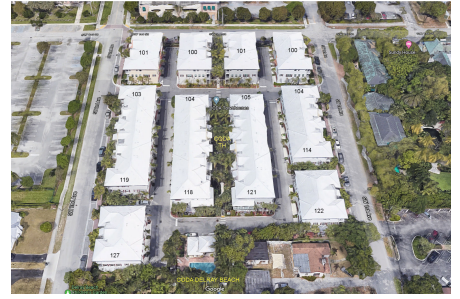
Built in 2007/2015 - 52 units - 3 floors

CODA Townhouses Address: 104 W Coda Cir, Delray Beach, FL 33444 Phone: +1 561-330-3144