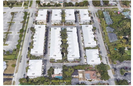
Built in 2007/2015 - 52 units - 3 floors

CODA Townhouses Address: 104 W Coda Cir, Delray Beach, FL 33444 Phone: +1 561-330-3144